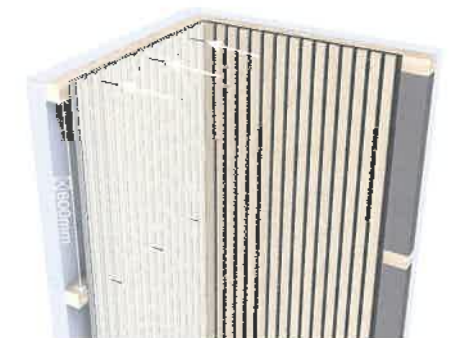
c. Install fiberglass wool or rock wool between the battens.