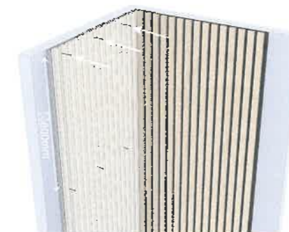
a. Nail acoustic panels directly to the wall.