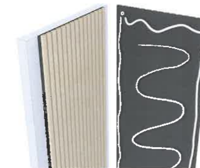
b. Attach acoustic panels to the wall with nail-free glue.