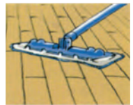
Wipe with a slightly damp Bona Cleaning Pad.