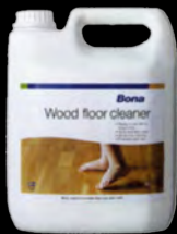
Bottle as a 4 litre refill