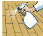
Spray with Bona Wood Floor Cleaner.