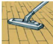
Remove dirt and grit.