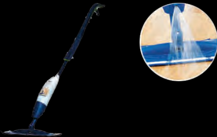
Bona Spray Mop.